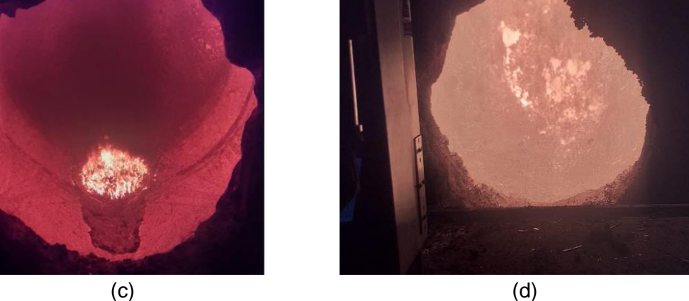
Figure 2 – (a) Load of hot repair mix big bag; (b) Low fumes emission; (c) Application on interested region; (d) Sintering process after complete thermal fluidity of the mix.